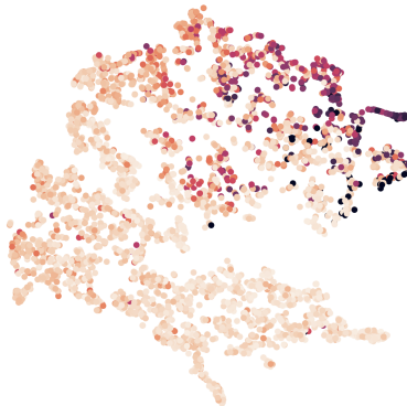
Figure 2: t-SNE visualization of embeddings from randomly selected time points spanning the available time series. Embeddings were visualized in two dimensions via t-SNE and colored by speeds at three timesteps (15 minutes) in the future to demonstrate the relationship between embedding similarity and true speed similarity.

These results are further supported by the qualitative study in Figure 2, which illustrates t-SNE-processed embeddings colored by future time point speeds. As indicated by their color, closely clustered embeddings generally share similar speeds. This suggests that embedding similarity is a proxy for speed similarity, and thus that embeddings are learning useful long-term information.